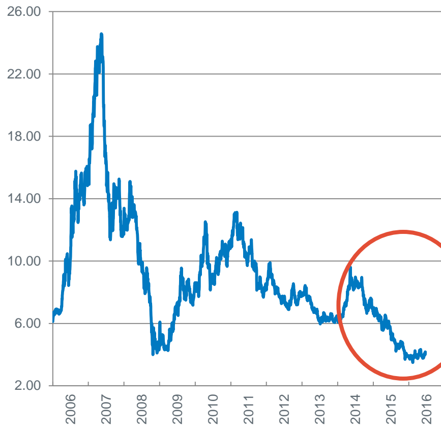
Nickel ($/lb) 10 years